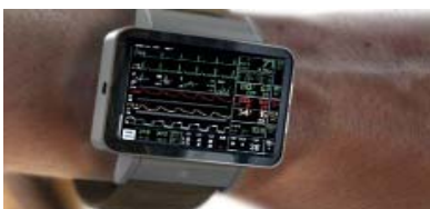
Possible end device (cf. www.pcadvisor.co.uk/news/apple/3443668/apple-iwatch-release-date-specs und www.absolutmed.com )

Possible Solution: Ideally, the nurse who has to make this decision should be able to immediately access the vital signs and patient data of the patient for whom the alarm is sounding. The vital signs would have to be optically retrieved from the monitor when the alarm goes off (e.g., with a webcam) and sent by wireless transfer to the nurse's mobile end device (e.g., a smart watch or phone). Existing monitors could be adapted to accommodate the new solution, which could therefore be introduced quickly in many hospitals.